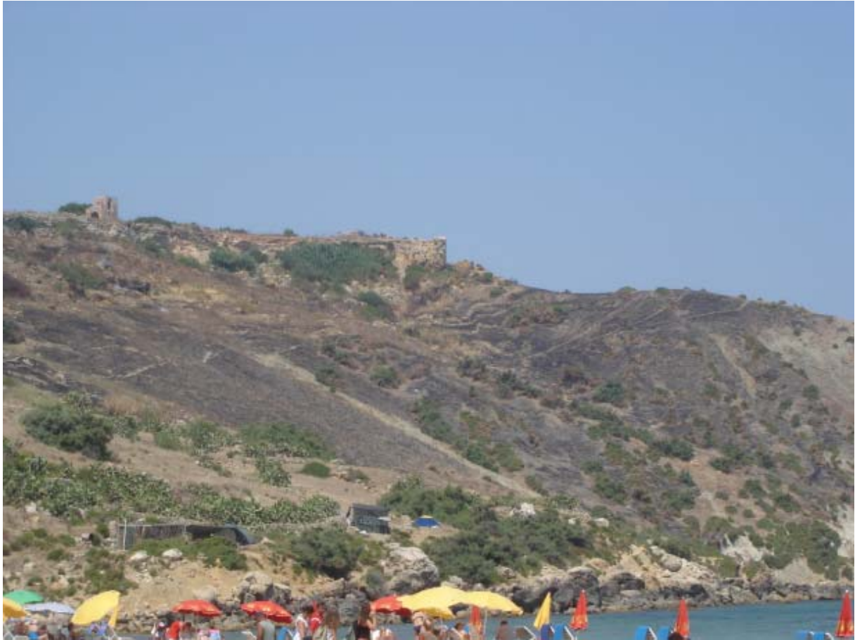
A major fire was affecting the clay slopes at Ramla Bay, outside the managed area, in June