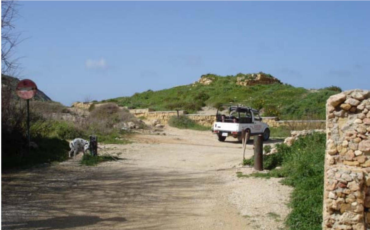
Broken padlock allows entry to vehicles