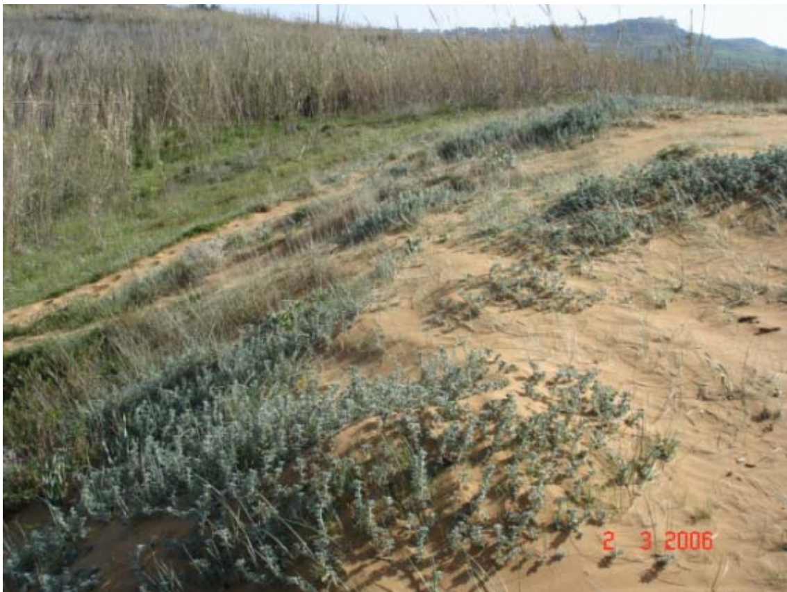
Giant Reed - Arundo donax (in the background) is invading the sand dunes