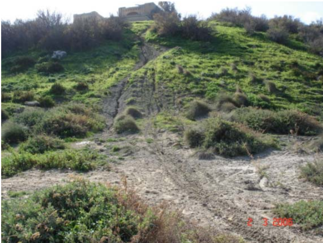
Tracks of offroading motorcycles on clay slopes